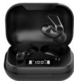
NeoBuds 11 GBI-2219

Upto 12 Hours Playback Time with Charging Case, Digital battery Indicator on case & MFB with Touch Sensor, Smart Voice Assistance, IPX4 Splash Proof