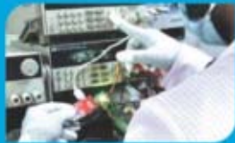
5 LAKHS+ MONTHLY PRODUCTION CAPACITY