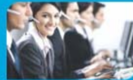
SERVICE CENTER ACROSS INDIA

We are honored to be part of Make In India campaign. Most of our products are made at our state-of-the-art factory situated at Kundli, Sonapat, Haryana which has capacity of making 5 Lakh products every month.