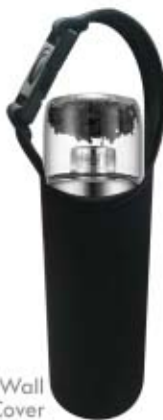
Double Wall With Cover