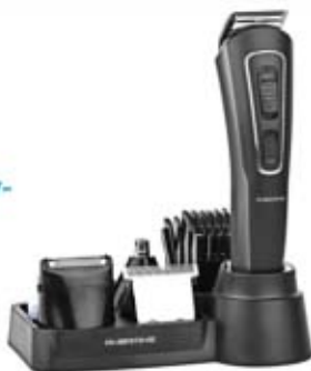
Cruiser Lite GBI-2220

Mens Grooming Kit, 5 Adjustable Combs, 4 Detachable Heads, USB Charging and Power Indicator 3 Speed Settings, Cord & Cordless use