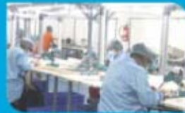
ON-TIME MANUFACTURE OF THE PRODUCT