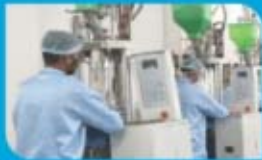
PROFESSIONAL TEAM OF DEDICATED EMPLOYEES